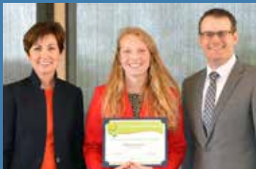
Scholarship recipients were recognized by special guests Iowa Gov. Kim Reynolds and Lt. Gov. Adam Gregg during an award ceremony hosted by Iowa Student Loan.

Thirty Iowa high school seniors each received $2,000 for college through the 2017–2018 Iowa Financial Know-How Challenge: Senior Scholarship, joining 100 previous recipients. Each recipient’s high school also received a $500 award for scholarship and financial literacy programs.