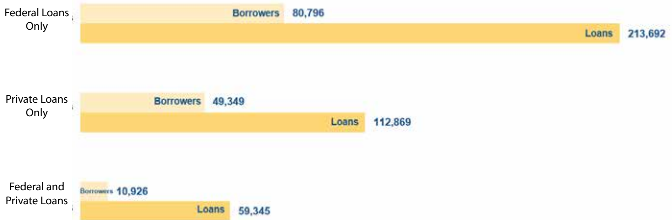
Federal and Private Loans Owned by Iowa Student Loan and Serviced by Aspire Servicing Center as of June 30, 2018 141,071 Borrowers and 385,906 Loans

Providing the necessary resources, information and assistance is critical to ensuring our borrowers can successfully repay their student loans. That is why Aspire’s loan counselors work diligently every day to provide customer service functions to more than 141,000 borrowers with private and federal student loans from our office in West Des Moines, Iowa, under the name Aspire Servicing Center SM .